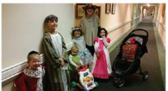
Delivering Mishloach Manot (Purim gifts) at The Monte Vista.