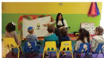
Learning the Purim story at Chabad Hebrew School.